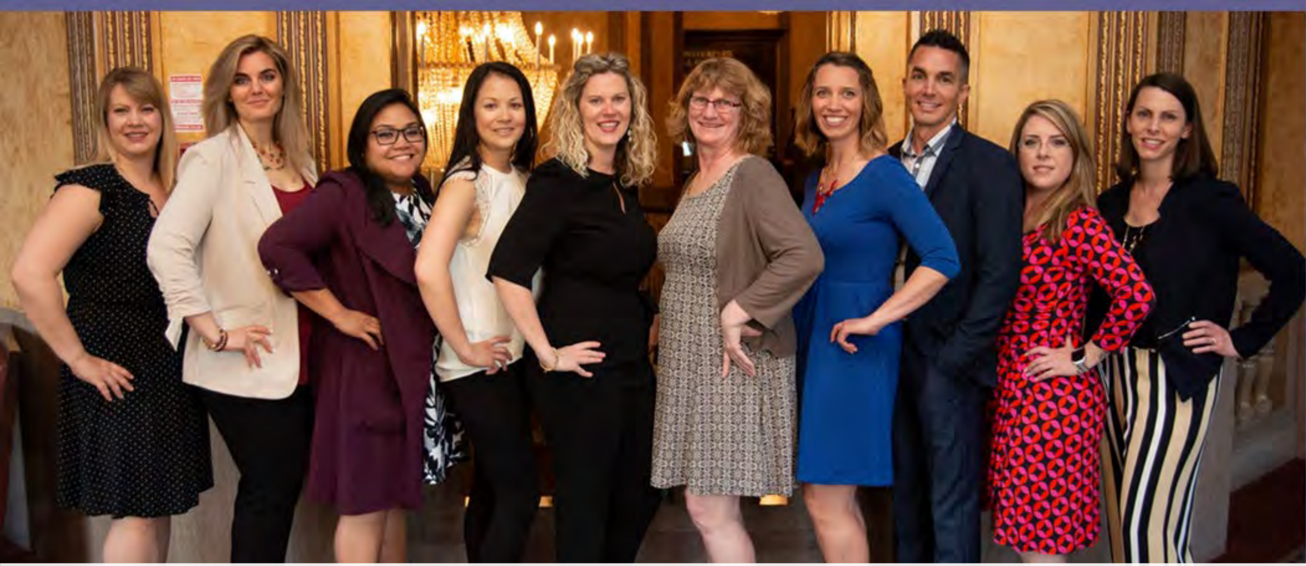
2019 – 2020 Board of Directors